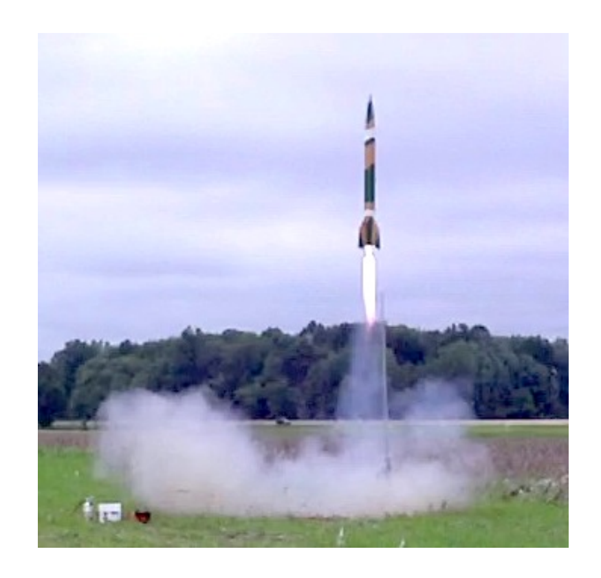
Mike Momenee (left) was finally able to make it to one of our launches and brought his scratch built 6" V-2 which he flew with an AT K1000 motor to an altitude of 2622 feet (above).