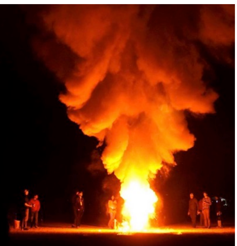
At right is the Annual Saturday Night "Party on the Playa" during which propellant from motors that have malfunctioned is burned off rather spectacularly. Below is a pic of two Burning Man participants who obviously got their dates wrong!